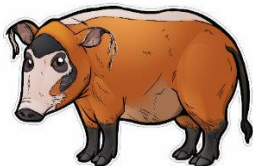
Red River Hog