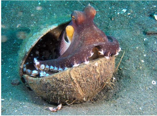
Octopuses use coconut shells to hide