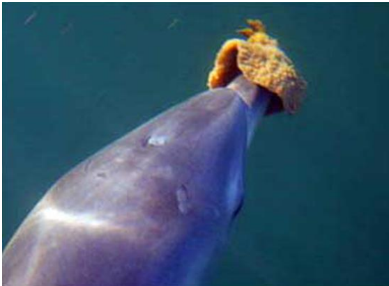
Dolphins use sponges to stir prey up from the ocean floor