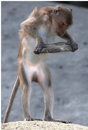
Macaques use stones to break open shells and nuts