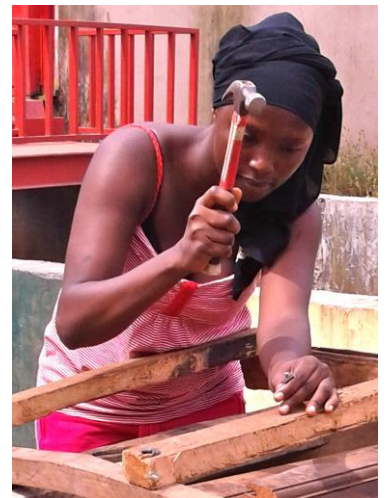
Humans use hammers to build