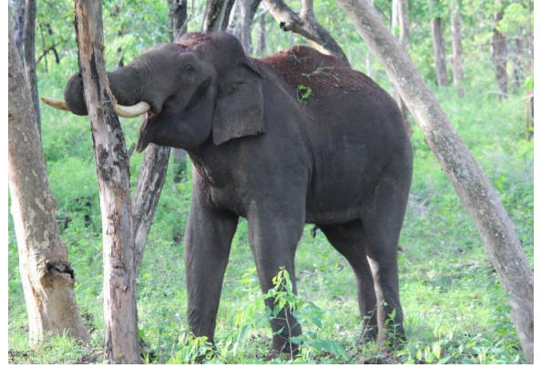
Elephants chew bark to make a plug for water holes